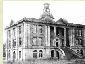
Sabine County Courthouse 1906

tionships with local businesses. Everyone who is reading this has made a great investment in our community, whether it is